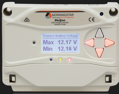
ProStar (Gen 3) Shown with optional meter